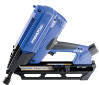
Gas powered wood nailer